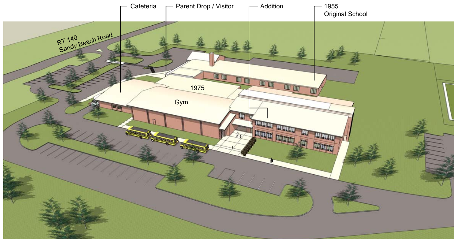
Crystal Lake School Aerial View from South Road